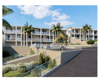
760 000 € (EUR €)